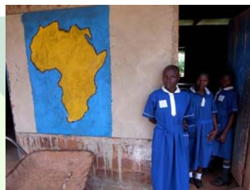
Students from the Bwetyaba Primary School in Uganda

We spent months working with a local logistics company who graciously helped us coordinate shipping and logistics. When the prospect of in-kind shipping fell through, we changed gears and developed a new plan to deliver packs and supplies to the children of Bwetyaba Primary School. Though our resources are limited, our commitment to the children is not. Backpacks, supplies and school uniforms will be delivered in 2011!